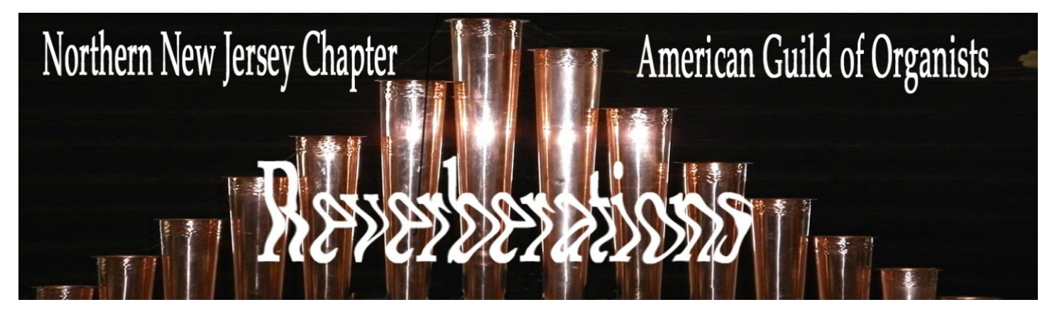
The Newsletter of the Northern NJ Chapter American Guild of Organists MAY 2022

Email: Northernnjago@yahoo.com Web: northernnjago.org YouTube: northern nj ago Facebook: Northern New Jersey Chapter of the American Guild of Organists Instagram: northernnjago